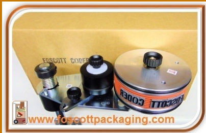
Free Running Unit