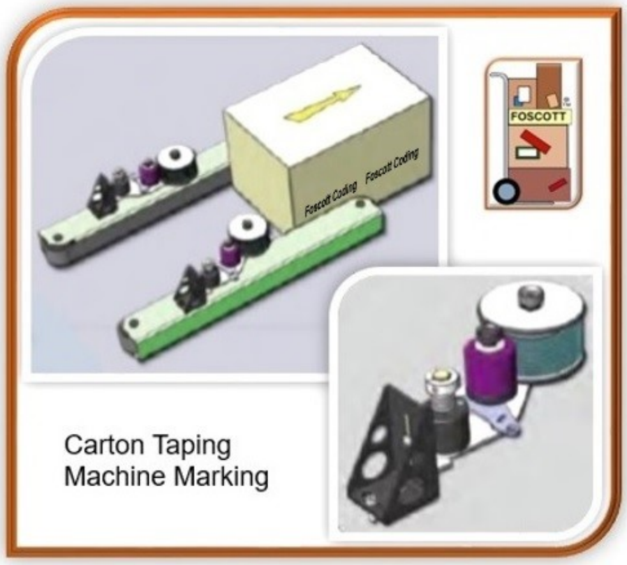
Carton Taping Machine Marking

Rollerpack printers / coders are also available for fitting to our Carton Tape Sealing Machine and a free rotation model for continuous printing.